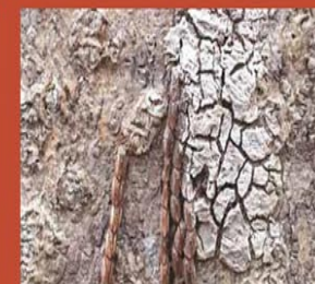
Egg mass (older) can be found January-June

THE PEOPLE YOU SHOULD BE CALLING! CONTACT US TO GET ON THIS PAGE TODAY!!