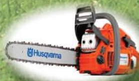
Husqvarna Chain saw