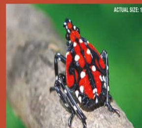
Nymph (late stage) can be found July-September