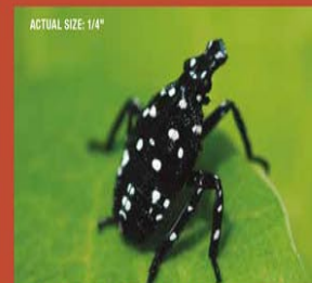
Nymph (early stage) can be found late April-July