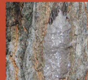
Egg mass (fresh) can be found October-December