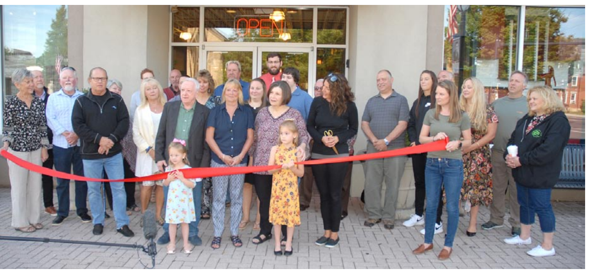
Visit www.bluevalleytimes.com/photogallery to see photos of this event