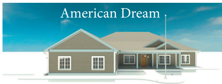
Designed Exclusively By Homes For Our Troops