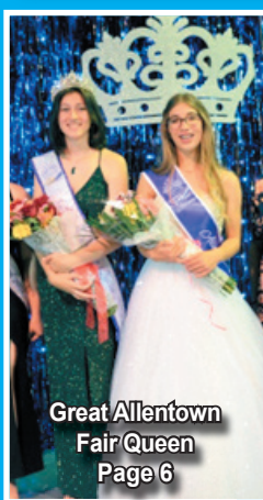
Great Allentown Fair Queen Page 6