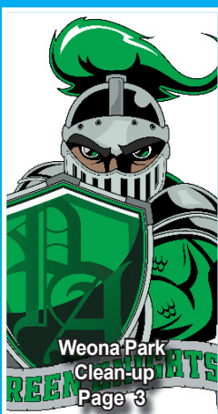
Weona Park Clean-up Page 3