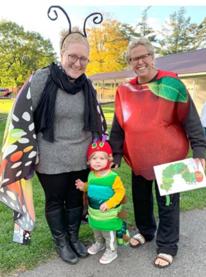
The hungry little catapillar