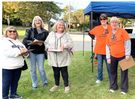
the Ladies that make it all happen