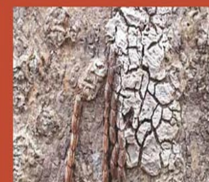
Egg mass (older) can be found January-June

THE PEOPLE YOU SHOULD BE CALLING! CONTACT US TO GET ON THIS PAGE TODAY!!