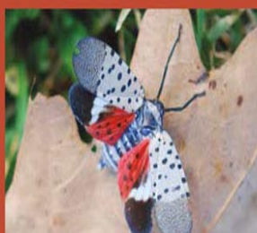
Adult (with wings open) can be found July-December