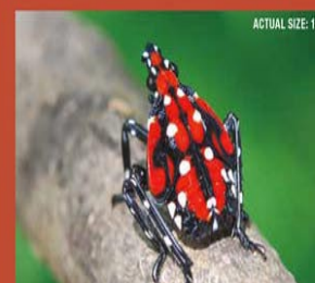
Nymph (late stage) can be found July-September