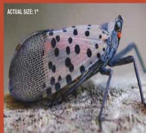
Adult (with wings closed) can be found July-December