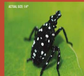
Nymph (early stage) can be found late April-July