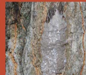
Egg mass (fresh) can be found October-December