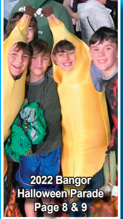
2022 Bangor Halloween Parade Page 8 & 9