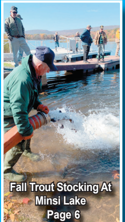
Fall Trout Stocking At Minsi Lake Page 6