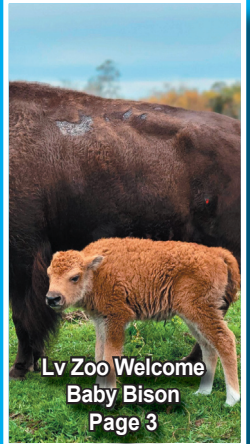
Lv Zoo Welcome Baby Bison Page 3