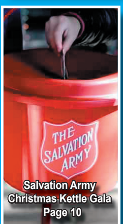
Salvation Army Christmas Kettle Gala Page 10