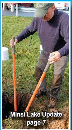
Minsi Lake Update page 7

VOL. 29 NO. 44 SERVING THE SLATE BELT, SOUTHERN POCONOS & NORTHERN N.J. DAILY ONLINE AT WWW.BLUEVALLEYTIMES.COM AND FACEBOOK NOVEMBER 2, 2021