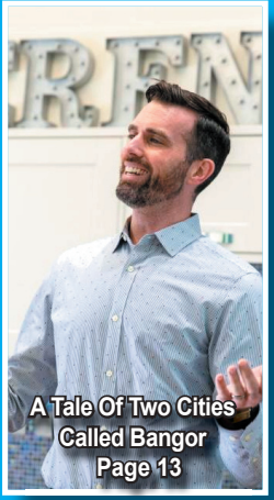
A Tale Of Two Cities Called Bangor Page 13