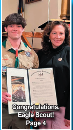
Congratulations, Eagle Scout! Page 4