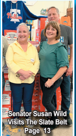
Senator Susan Wild Visits The Slate Belt Page 13