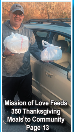
Mission of Love Feeds 350 Thanksgiving Meals to Community Page 13