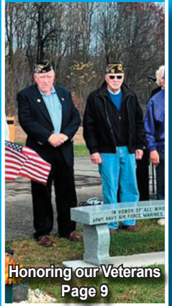
Honoring our Veterans Page 9