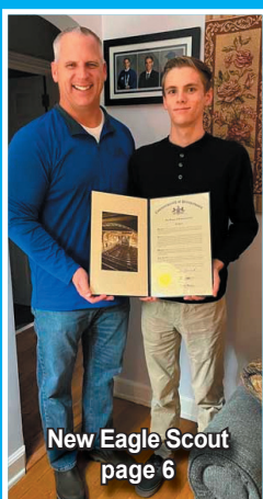
New Eagle Scout page 6