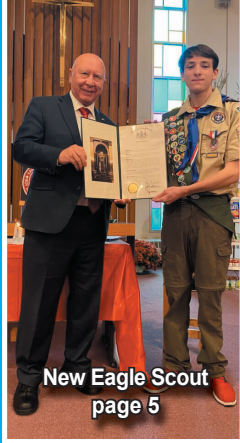
New Eagle Scout page 5