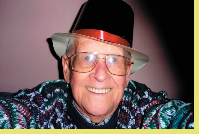
My Pilgrim Hat For Turkey Day. Happy Thanksgiving To All !!