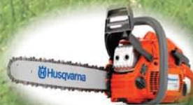
Husqvarna Chain saw