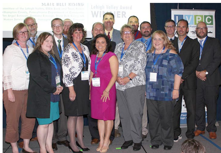
Slate Belt Rising