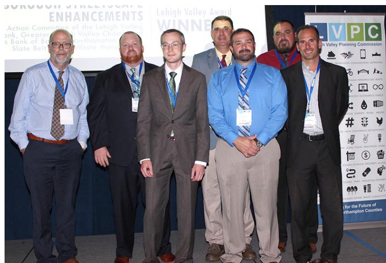
Bangor Borough Streetscapes Enhancements project