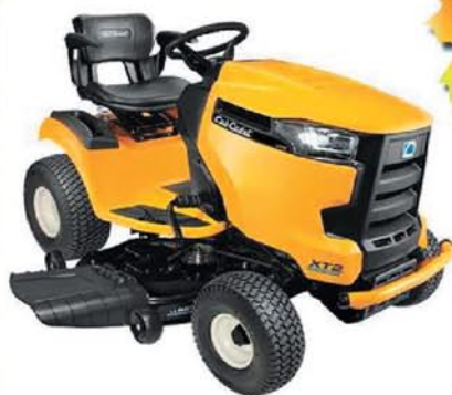
Cub Cadet XT Enduro Series