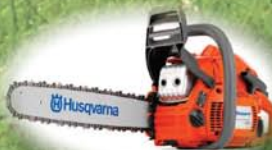
Husqvarna Chain saw