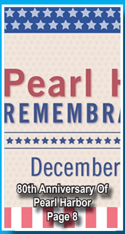
Pearl Harbor REMEMBRANCE December 80th Anniversary Of Pearl Harbor Page 8