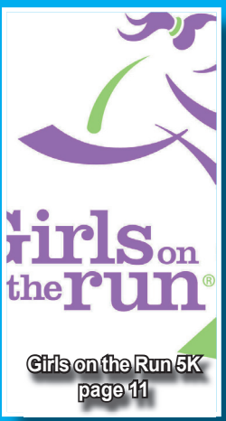
Girls on the Run Girls on the Run 5K page 11