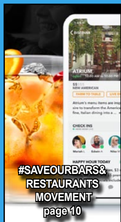
#SAVEOURBARS& RESTAURANTS MOVEMENT page 10