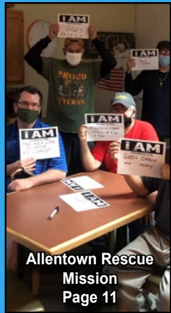
Allentown Rescue Mission Page 11