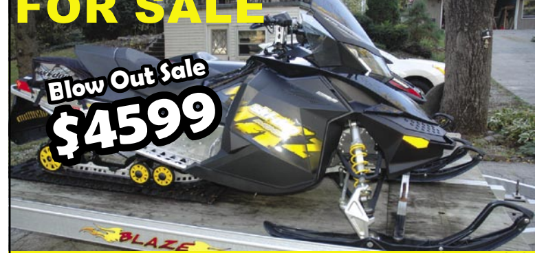
2009 MXZ 800R PTEK-E ADRENALINE SKI DOC 50TH ANNIVERSARY EDITION

Excelent Condition, Electrict Start, Reverse, Studded Track, Heated Hand Grips, Rear Removable Storage bag, New Battery, Gagage Kept, Storage Cover, Purchased and Serviced by Horn's Outdoor. 5460 miles. $5500.00 OBO 'Also Lots Of Accessories Available'