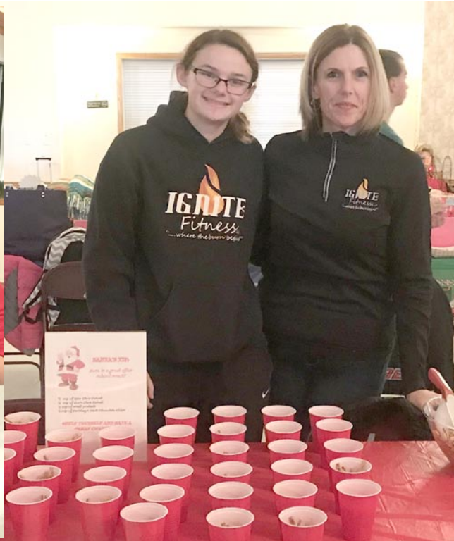
Breakfast with Santa Continued from page 1

Go to www.bluevalleytimes.com to see all the photos of these events