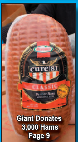
Giant Donates 3,000 Hams Page 9