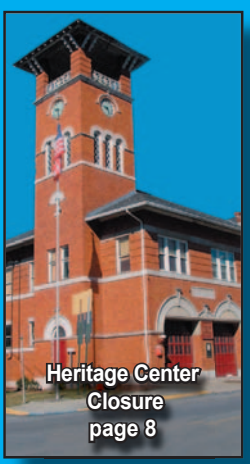
Heritage Center Closure page 8