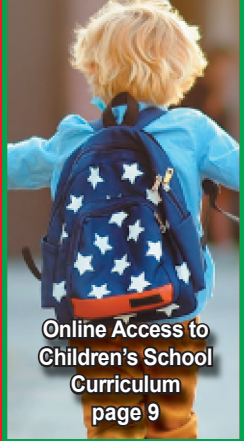
Online Access to Children's School Curriculum page 9