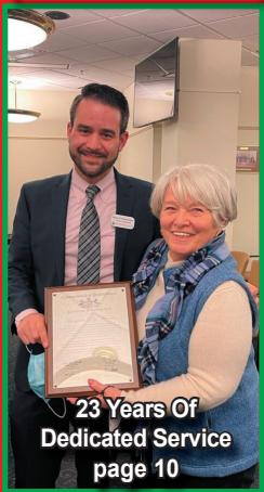
23 Years Of Dedicated Service page 10